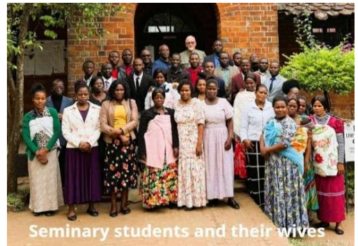
Seminary students and their wives